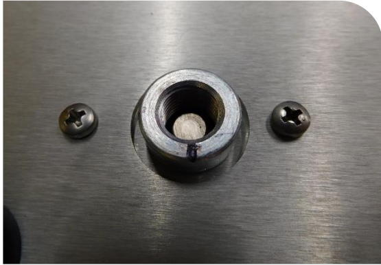
Figure 7. Place Plunger Back into Solenoid