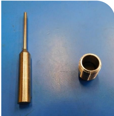
Figure 3. Metal Plunger and Adjustment Screw