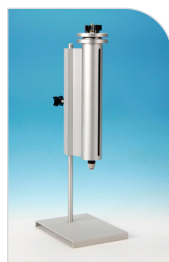
12 oz (300 mL)