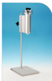
6 oz (160 mL)