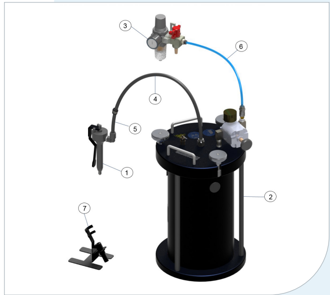
Representative Model 200 Dispensing System (T20145 with Bottle Reservoir Shown Below)