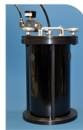
Bottle Drop-In Reservoir