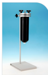
20 oz (550 mL)