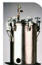
Pail Drop-In Reservoir