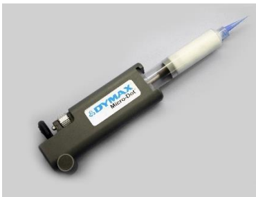
Figure 3. Micro-Dot (Thumb) PN T20000